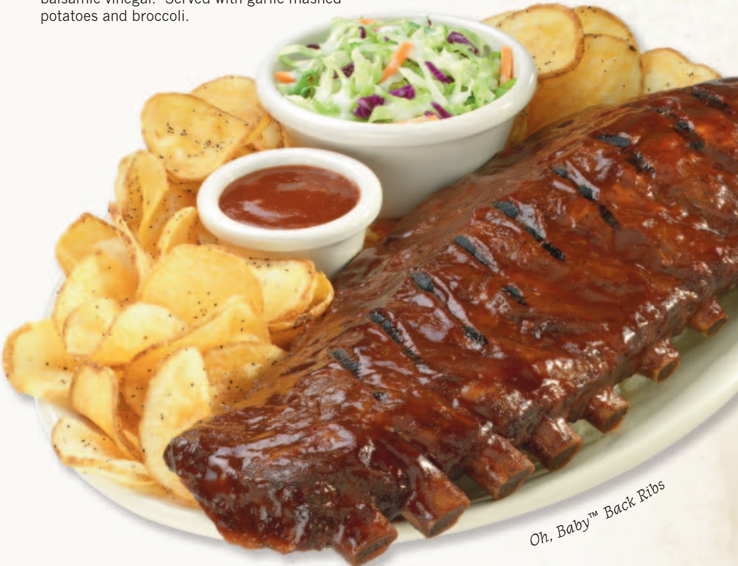
Oh, Baby™ Back Ribs

Southwest Fajitas Chicken, Steak or Combo Served with sour cream, pico de gallo, lettuce, cheese and rice pilaf.