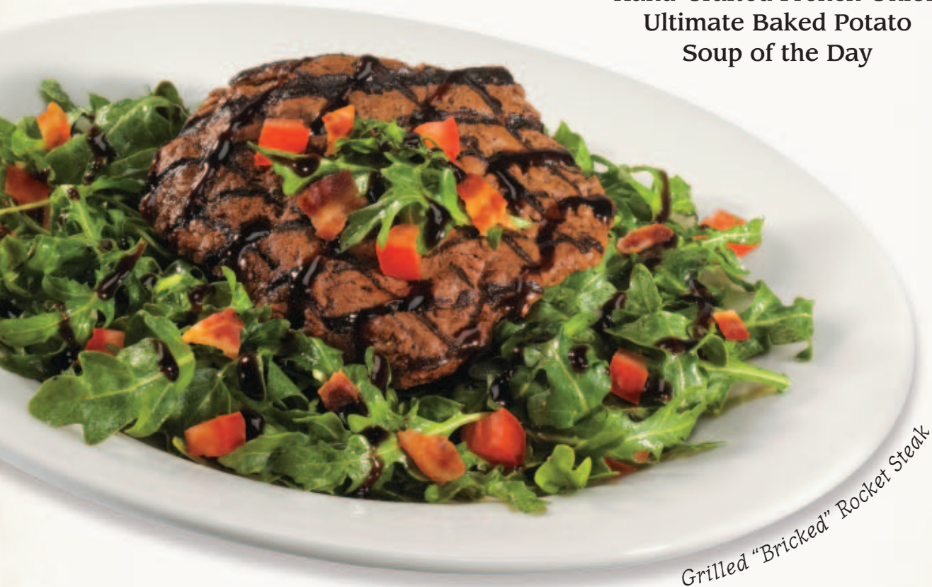
Grilled "Bricked" Rocket Steak

A "brick-flattened" fire-grilled 4oz. Choice sirloin steak on top of a Rocket arugula salad with tomatoes, garlic and crispy bacon pieces. Drizzled with a balsamic glaze.