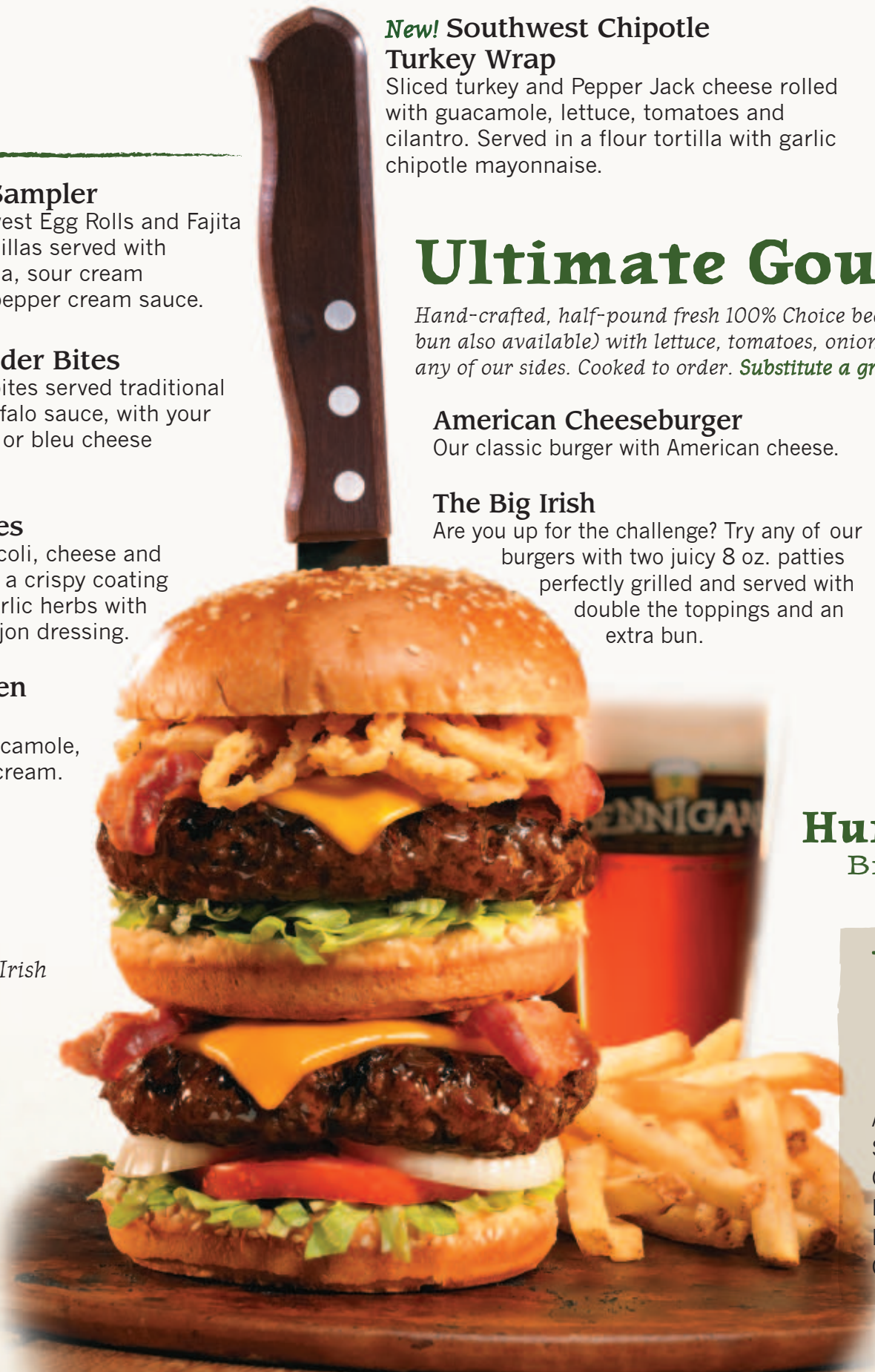
The Big Irish

Fajita Chicken Quesadillas Served with guacamole, salsa and sour cream.