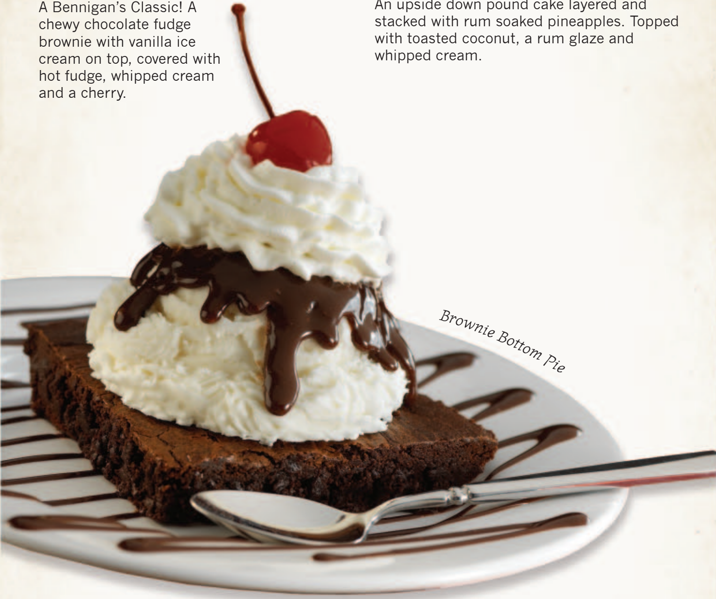
Brownie Bottom Pie

A Bennigan's Classic! A chewy chocolate fudge brownie with vanilla ice cream on top, covered with hot fudge, whipped cream and a cherry.