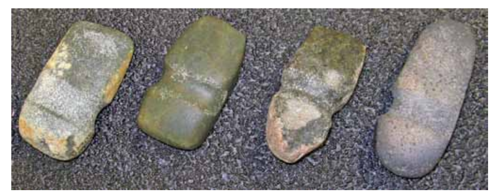
Ancestral Puebloan Axe Heads

Imagine a place that protects pieces of natural and cultural history, from artifacts centuries old to fossils millions of years old. This place is the Petrified Forest National Park Museum Collection. More than 200,000 objects are housed in the collection, including archeological objects recovered from hundreds of sites within the park's boundaries and associated field records; ethnological objects related to Hopi and Navajo cultures; Triassic fossils; Park Photographic Archive; representative geological specimens collected from the park; and the biological collection (both plants and animals). The museum collection provides a window of discovery into the Late Triassic its flora, fauna, and geology, as well as millennia of human use and occupation, and the current environment—an aid to understanding and education among researchers, park staff, and park visitors. Explore some of the objects in the collection at the Rainbow Forest Museum and at http://www.museum.nps.gov/pefo/page.htm.