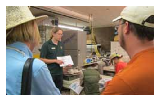
Exploring the palleontology laboratory