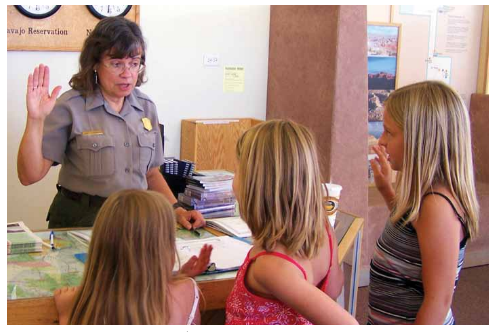
Junior Rangers are sworn in by one of the rangers

We invite YOU to become a member of this very special group of people. Help protect our national parks and join the team. Become a Petrified Forest National Park Junior Ranger today!