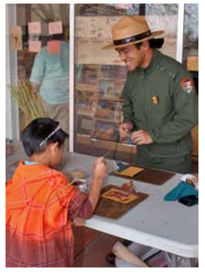
Paint with a ranger

Check for more special activities and details at the park website <a href="http://www.nps.gov/pefo">http://www.nps.gov/pefo</a> or call 928-524-6228.