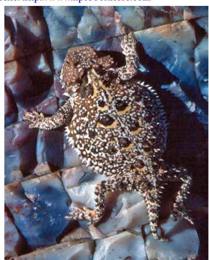
Short-horned lizard on petrified wood

Promoting scientific research and resource