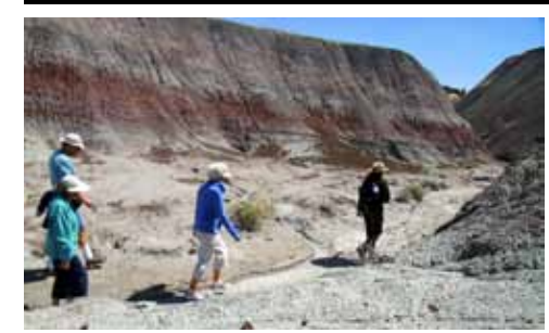
Off the Beaten Path Hike with a ranger