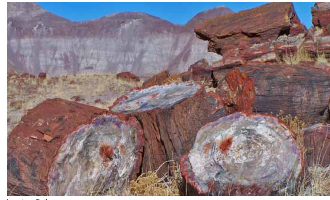
Long Logs Trail

Stay on designated trails in developed hiking areas. Offtrail hiking damages the fragile grassland environment and disturbs wildlife habitat, creating unsightly "social" trails. Leaving the designated trail can also be hazardous for hikers due to loose rock and dangerous cliffs. Pets must be kept on leash at all times. Pets are not permitted in the park buildings (except for service animals). Please clean up after your animal; use the trash receptacles. Bicycles are not allowed on trails or off roads at any time.