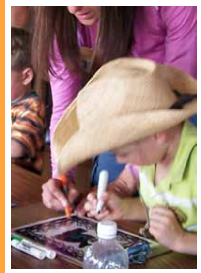
Create your own historic panel