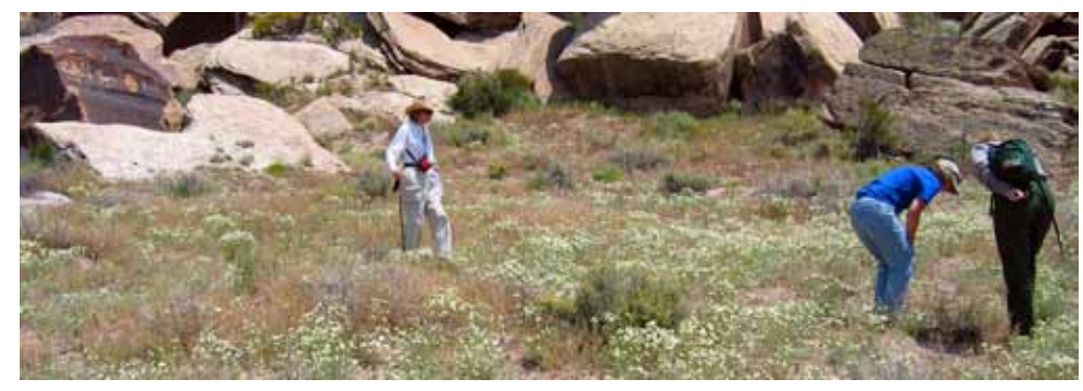
Wildflower watching at Petrified Forest

Additional activities, and events occur throughout the year. Call 928-524-6228 for more information, check at one of the visitor facilities when you come to the park, or visit <a href="http://www.nps.gov/pefo">http://www.nps.gov/pefo</a>.