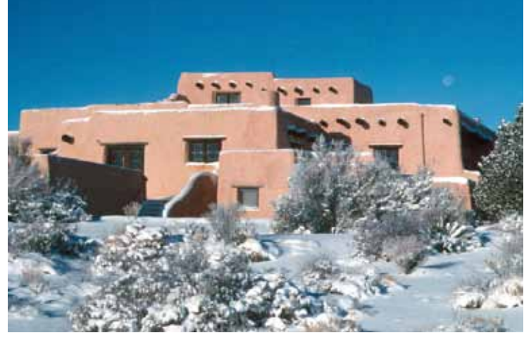
Painted Desert Inn National Historic Landmark in the snow.

Winslow Chamber of Commerce http://winslowarizona.org/ 928-289-2434