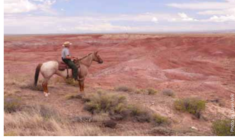
Ranger and partner overlooking the Painted Desert