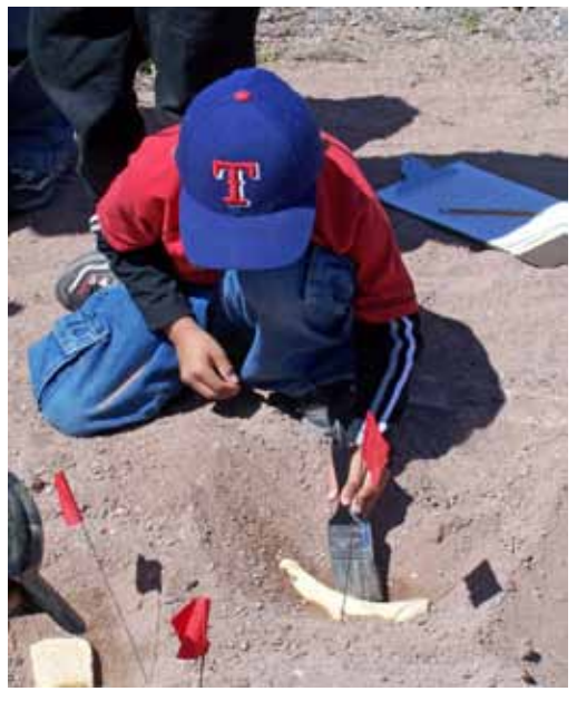
Students explore science at Petrfiied Forest

Educators! Bring your students to Petrified Forest National Park for a ranger-led program that will meet your curriculum needs. The park has endeavored to provide motivating educational opportunities for students while meeting several Arizona Academic Standards. We are always delighted to have classes visit the park with the desire to learn more about this extraordinary place.