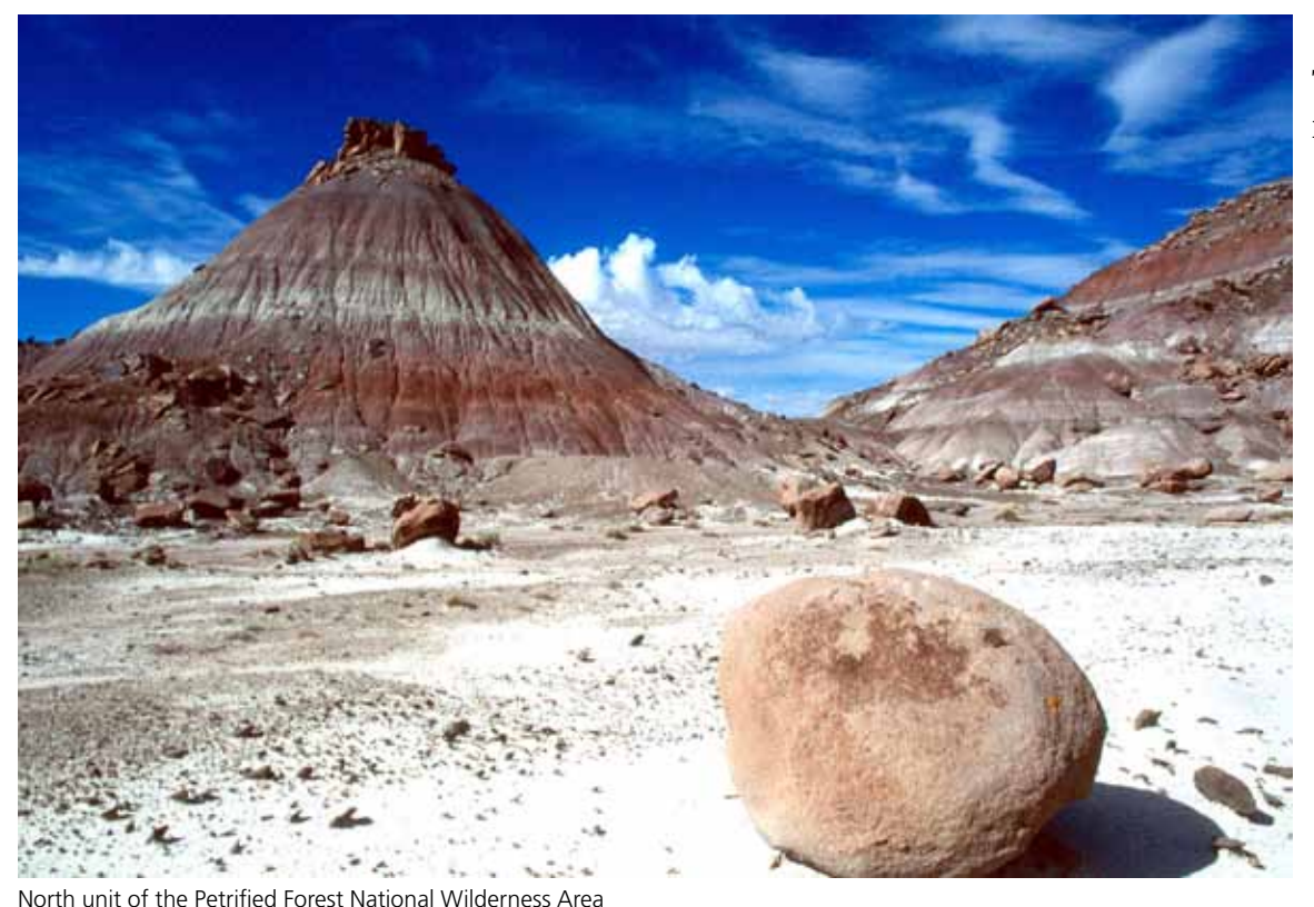
North unit of the Petrified Forest National Wilderness Area

The trail down to the northern unit of the wilderness area can be very steep with an unstable surface. While there are no maintained trails in the wilderness areas, there is very little grade change and riding is easy. Petrified wood is sharp and can cause damage to stock hooves. Take care of yourself, your stock, and your park.