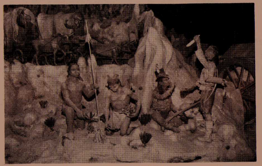
Scene From HISTORAMA Early Apache Inhabitants

Kids and adults are fascinated by Historama's blend of motion pictures, historic photos, and laser-controlled animated figures moving on a revolving stage.