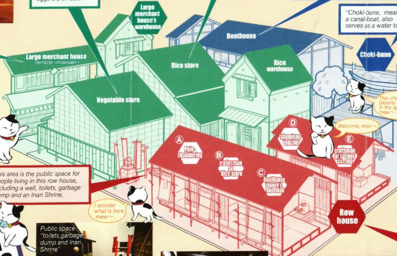
This area is the public space for people living in this row house, including a well, toilets, garbage dump and an Inari Shrine.