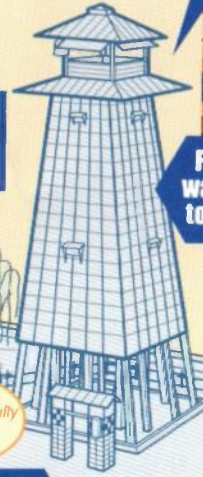
Fire watch tower