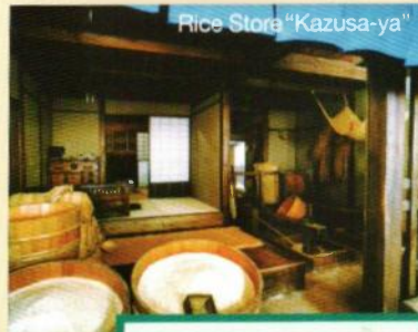
Rice Store "Kazusa-ya"