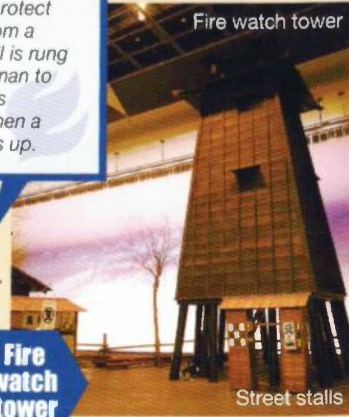
Fire watch tower