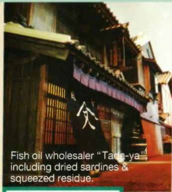
Fish oil wholesaler "Tate-ya" including dried sardines & squeezed residue.