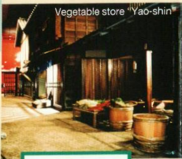
Vegetable store "Yao-shin"