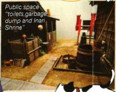
Public space "toilets, garbage dump and Inari Shrine"