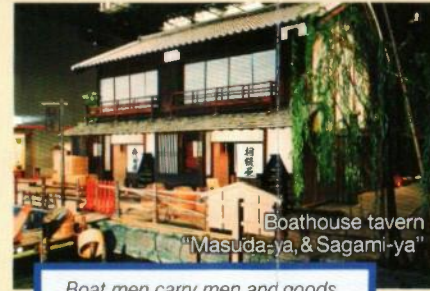
Boathouse tavern "Masuda-ya, & Sagami-ya"